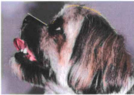
Figure 3. Exposed white of the eye as a result of a shallow orbit in the skull. Measured with the dog looking forward. (shade the quadrantes)